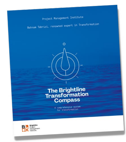
Download your copy of the compass at https://compass.brightline.org/

That leaves a big question: "How do we move barriers so that people will step into greatness and fully align and find real joy at work?"