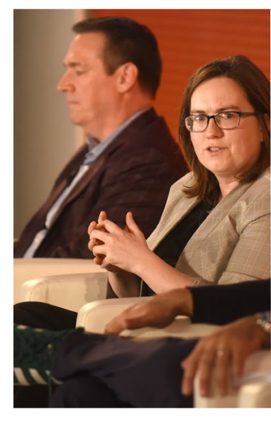
Strategy@Work 2019 Executive Summary