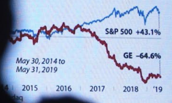
Performance of GE Shares vs S&P 500

General Electric's Investors Misjudged the Transition to Navigate the Transition of Billions